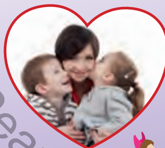
hugs and kisses